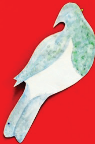
layer, texture and blend