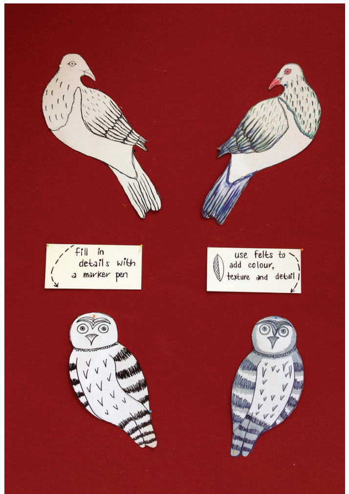
Step 3 & 4

Print the templates on to A4 paper, use them to trace the outlines onto card. Light card is better than paper because it is stronger so will hold the addition of paint, glue and other materials.