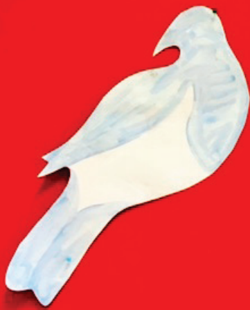
outline or wash

If you want the bird to have a softer look, don't outline the features in pen just paint them on.